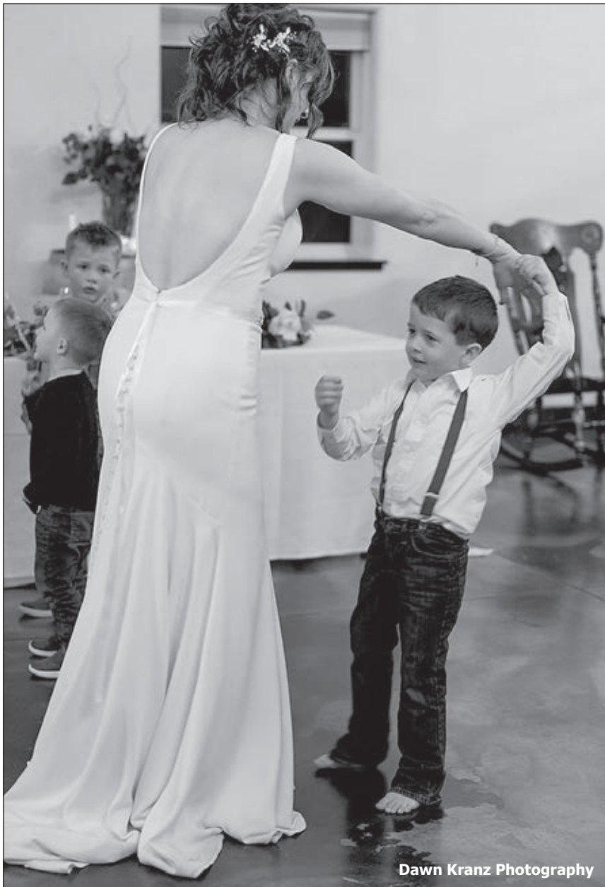
Dawn Kranz Photography

Color & Extension Specialist - Luxury Clean - Organic - Hair Health