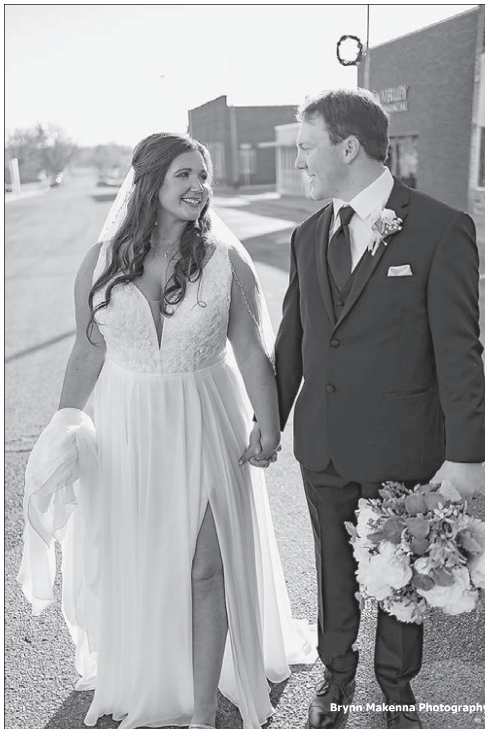
Brynn Makenna Photography