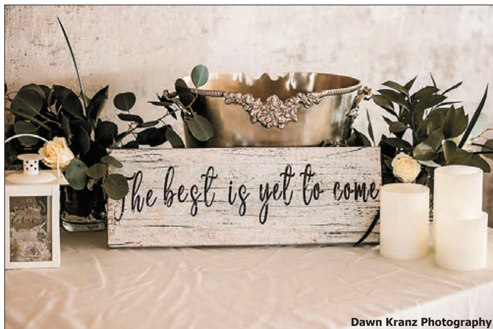
Dawn Kranz Photography