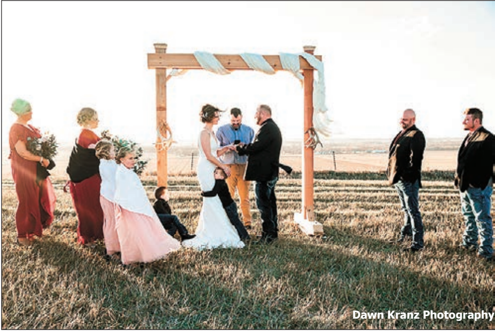
Dawn Kranz Photography