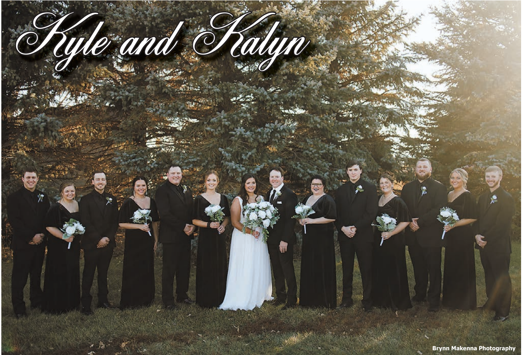
Brynn Makenna Photography