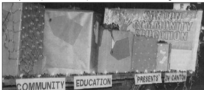
This is a "Canton Community Education Float. The winner of Best Floats of 2009 are Best Religious - Lutheran Youth Group, Most Humorous - Booster Club, Best Over-all - Lincoln County Cruisers, Mayors Choice - First Bank and Trust, Chambers Choice - Community Education and Most Beautiful - Sunshine Foods.