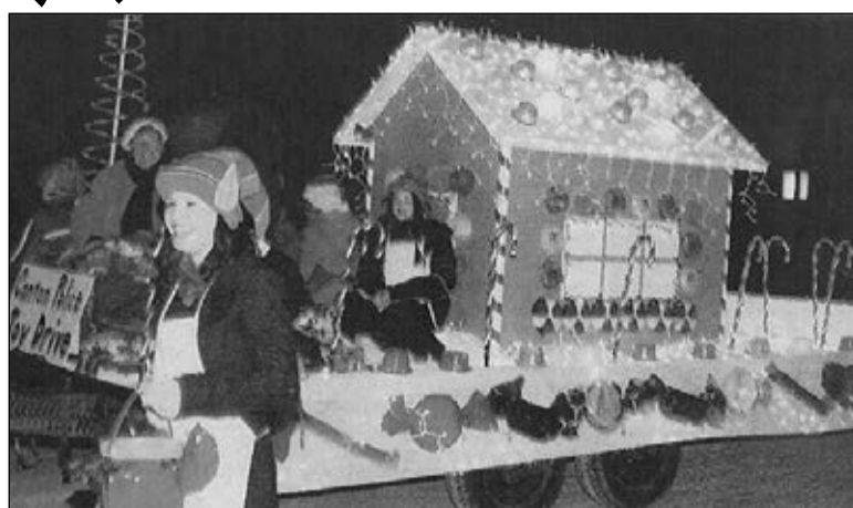
This is a 2009 picture of the Christmas parade downtown. This was the City of Canton and the float was called a sweet delight, probably because of all the candy and sweets.