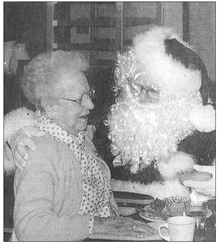
This 2007 picture shows a Santa Claus entertaining the elderly folks. Christmas brings all sorts of good things and places to go.