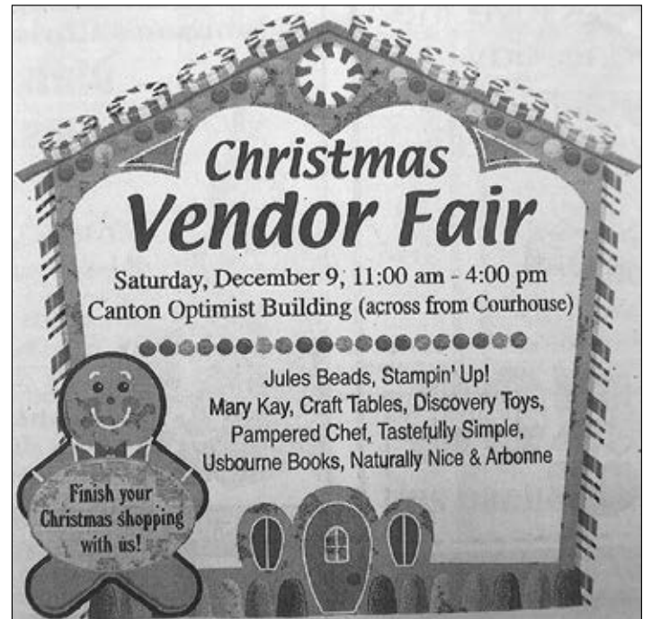
This was 2007 ad Sioux Valley News telling about a big vendor sale to be held down on 5th street in the Optimist building. Tables could be rented for nominal fee and good baked goods also could show up.