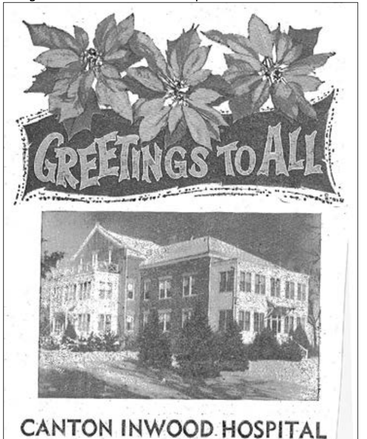
This is a 1961 picture of Canton Inwood Hospital out east on some of the ground where today's hospital sets. This served the area for many years. The front entrance was on the west side or left side of the picture.