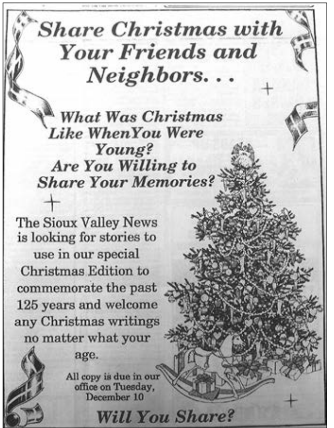
This was a 1991 Sioux Valley News ad asking for readers to bring their Christmas stories in to be shared by the public. They really wanted to know what Christmas was like when they were young.