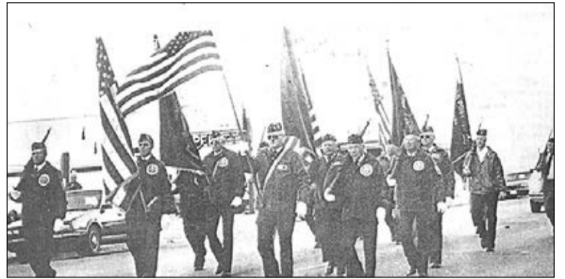
This is a 1990 Veteran's Day parade in Canton downtown. The America Legion was also involved with all activities.

Edward Jones, Member SIPC Edward Jones www.edwardjones.com Member SIPC