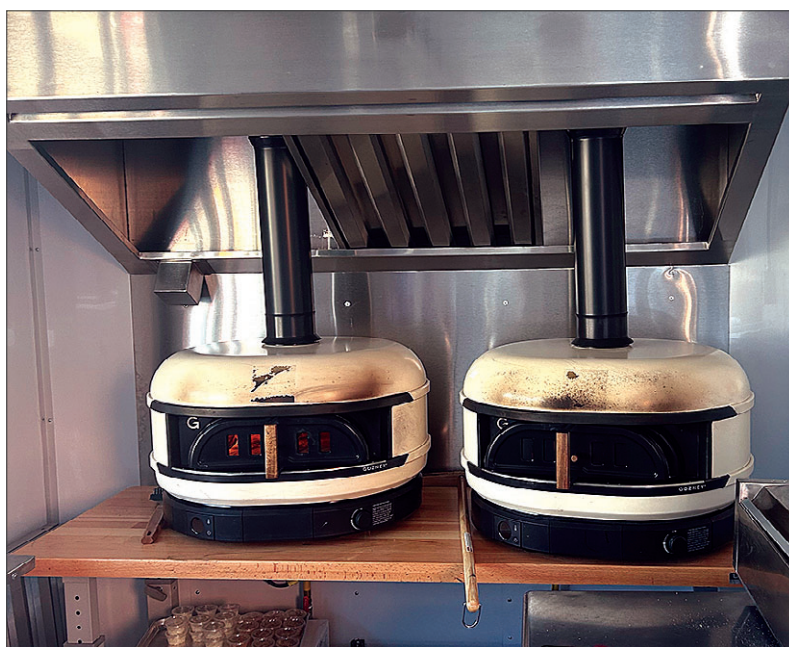
Two pizza ovens are located at the far end of the food trailer. These ovens cook the pizza at a high temperature so it takes less time to bake.