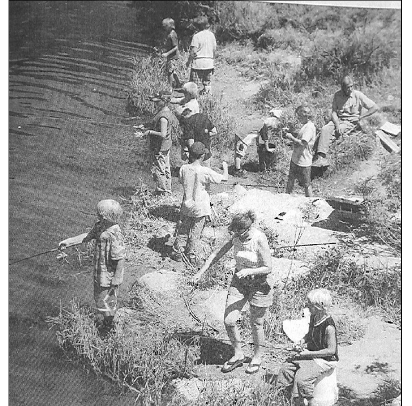
This is a lot kids on the shore getting started. This was one event I helped with for several years. We were not to help them catch a fish, but did teach them the basics of tying on hooks and using worms for bait. We had many kids whose mothers brought them and we had to teach the kids from the very beginning basics.