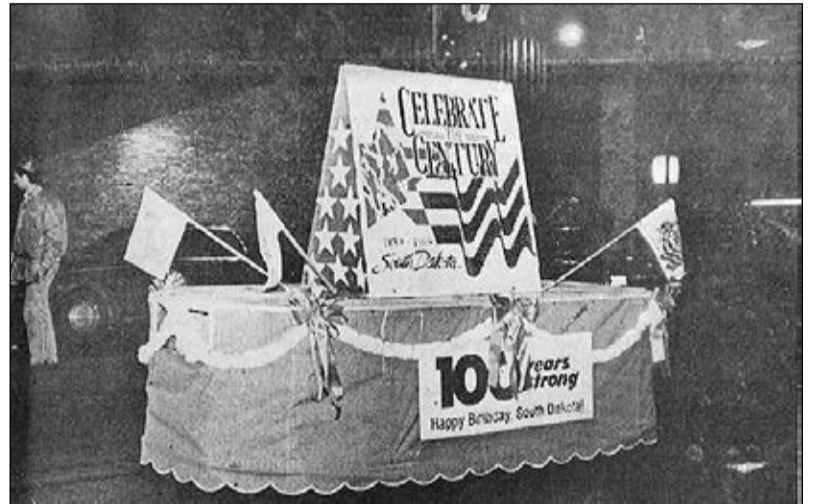
This 1988 parade float was part of the big celebration of the century that happened over the year.