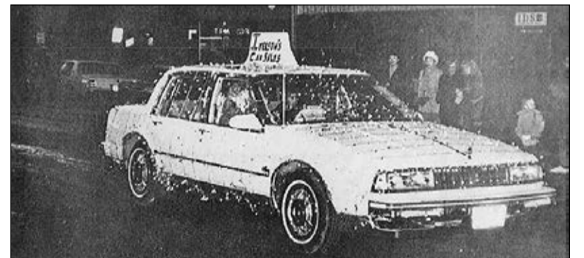
We don't remember why this parade entry was here, but it was unusual. This was a regular "yellow cab" from Sioux Falls that gave us a visit. Maybe a Canton person lived here in town but worked for the cab company in Sioux Falls.