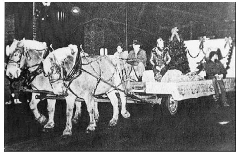
This is a 1988 Optimist Christmas Parade in downtown Canton. We think this horse drawn float may have come down from north of Sioux Falls. They came down over several years, and it was a lot of hard work for them.