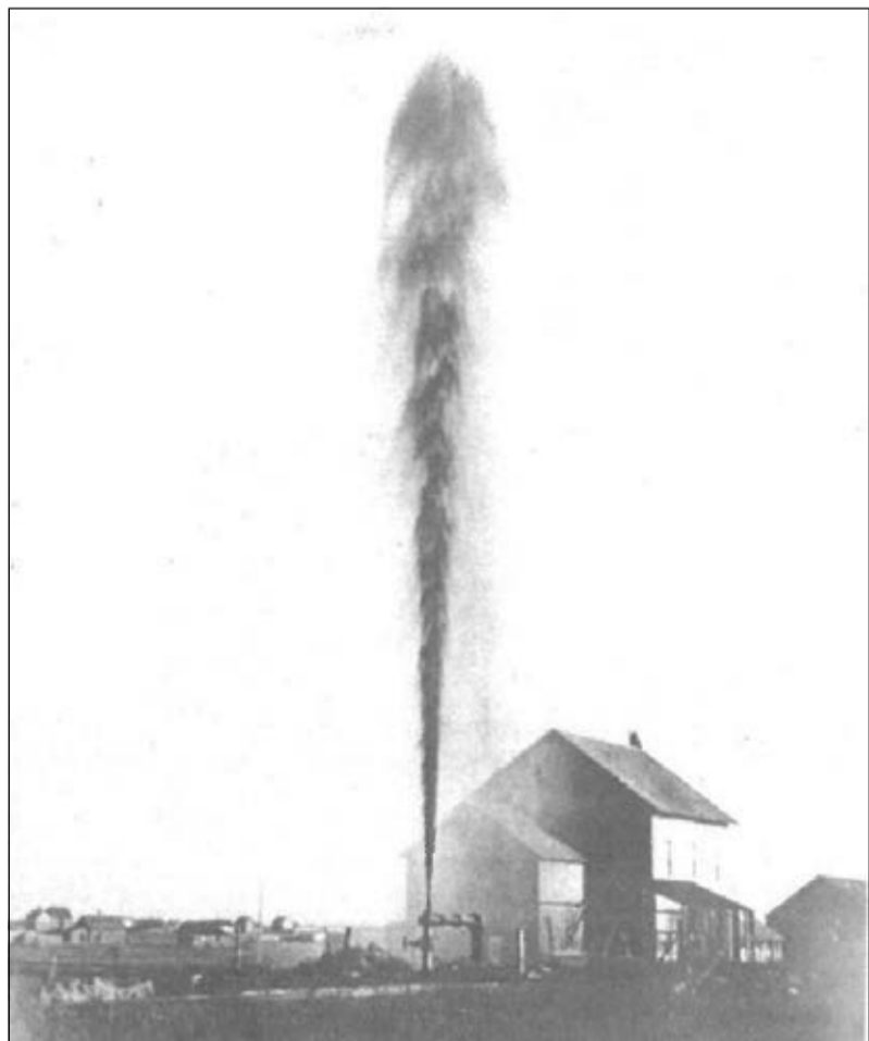
South Dakota has strange water mostly in Western portions, but here and there it can happen anywhere. This is a large Artesian well spouting a lot of water into the sky. This well was up at Woonsocket, S.D. and happened quite a while ago. It looks like an oil well just drilled, but it is only water.