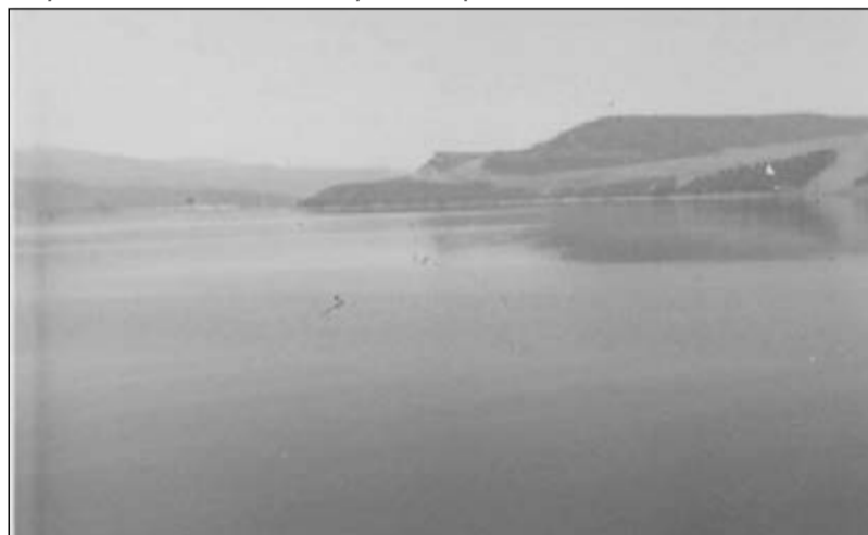
This is the Great Salt Lake in Utah, right north of the famous Bonneville racing flats in the desert. We swam in this highly salt lake a long time ago on a trip to Reno, Lake Tahoe and California. There is no sinking, but burning sensation all over the body. There were fresh water sprinklers up on the beach to rinse the burning salt off. The only other salty lake or sea is the Dead Sea in the middle east in Israel. But Great Salt Lake is a huge Lake, although shallow in many areas. Migrating birds coming down from Canada will stop and land in the water to rest, only for a while.