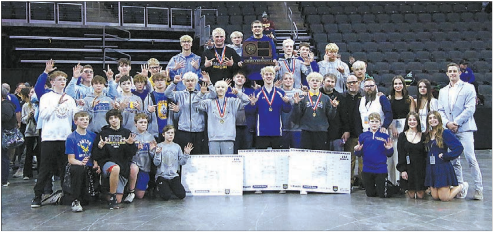
The Canton C-Hawk boys wrestling team traveled to Sioux Fall for the 2024 State B Wrestling Tournament and came home with their 7th consecutive State B wrestling Championship and their 9th overall wrestling state championship. Canton held off Phillip/Kadoka Area/Wall 170.5 to 138.5 with the help of 3 State Champions and 7 placemen.