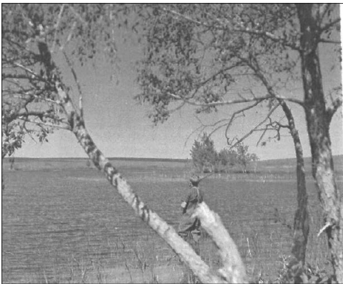
This is Medicine Lake up in north east South Dakota just northwest of Watertown. It is a very small lake, it is a salt lake with water coming in out of a spring and dumping these minerals and salt into it. This is about 9 to 13 miles northeast of Henry, S.D. It really isn’t good for much except some people bathe in it to soothe aching muscles - joints no animals can live in this except for possibly some salt water tiny shrimp.

Trust me, the ending is worth the read. Have your tissues ready! This novel was a very quick read and if you are a fan of historical fiction, you will enjoy this one.